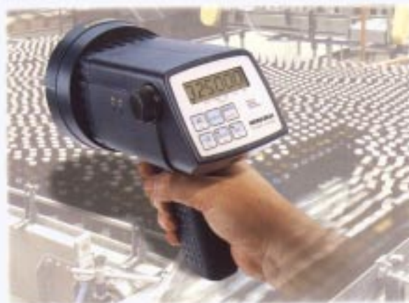
Phaser-Strobe PB 115