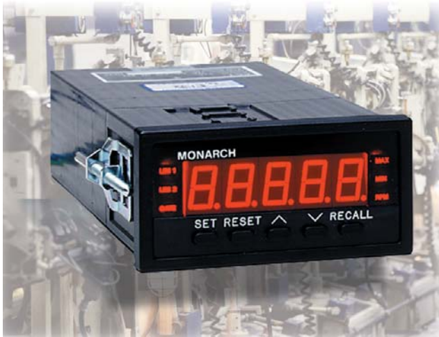
ACT-3 Panel Tachometer/Ratemeter/Totalizer