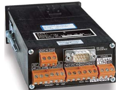
ACT-3 Panel Tachometer/Ratemeter/Totalizer