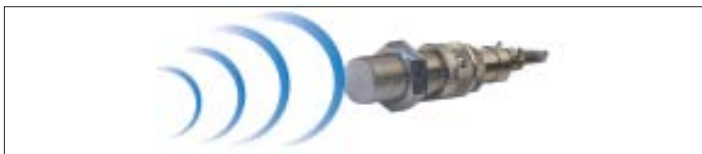
Inductive (200-20,000 RPM) Gasoline Engine RPM.

IRS-5W or IRS-5P: Ideal sensor for working 0.5 to 1.0 inch (12 to 25 mm) from high speed equipment or other applications providing only contrasting light and dark surfaces or beam interruption by solid objects. Common usage: Dentist and other high speed drills, slots or gear teeth. Does not require reflective tape.