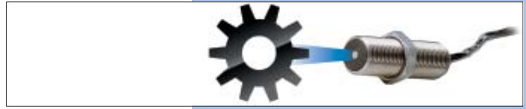
Magnetic (1-99,999 RPM) Self-powered gear sensor.

GE-200: Ideal sensor for gasoline engine RPM, working 0.5 to 4.0 inch (12 to 100 mm) from ignition coil or magneto. Common usage: 2-cycle and 4-cycle gasoline engines.