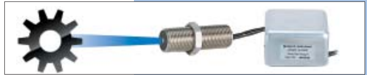
Magnetic with Amplifier Module (1-99,999 RPM) Amplifier enhances performance of M-190 magnetic sensor.

M-190W or M190P: Most popular sensor for use with 60 tooth 20 pitch gears. Sensor mounts within 0.005 inches (0.127 mm) of a minimum 0.1 inch (2.5 mm) target. Requires no power from the display module and self-generates an AC signal. Common usage: Ferrous metals, primarily gear teeth.