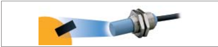
Proximity (1-60,000 RPM) Rugged industrial sensor.

ROS (Remote Optical Sensor): Threaded stainless steel remote optical sensors have a visible red LED light source and green LED 'On Target' indicator. Perform over a wide speed range and operating envelope. Modulated and High Temperature versions available. Common usage: Wide range of general purpose applications in relatively clean environments.