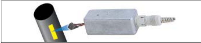
Infrared (1-999,990 RPM) Reliable high speed sensor.

P5-11: A two wire probe style inductive sensor for use up to 0.2 inches (5 mm) from 0.5 inch (12 mm) metallic target such as bolt head or shaft locking key. Common usage: Permanent installation in harsh industrial environments. Target is Reflective Tape.